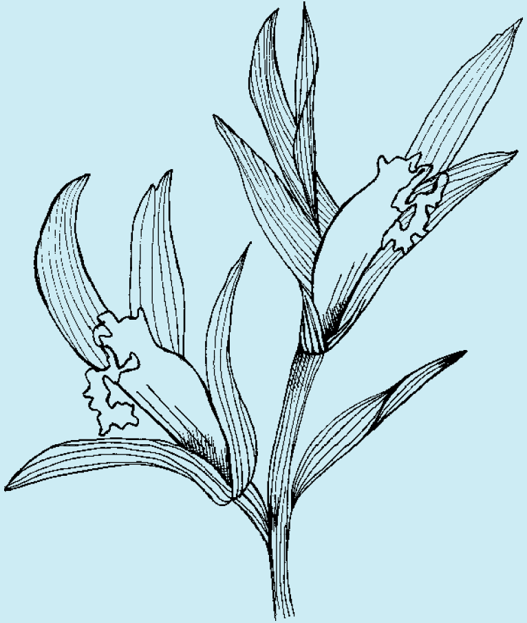
Pencil Orchid (Dendrobium beckleri)