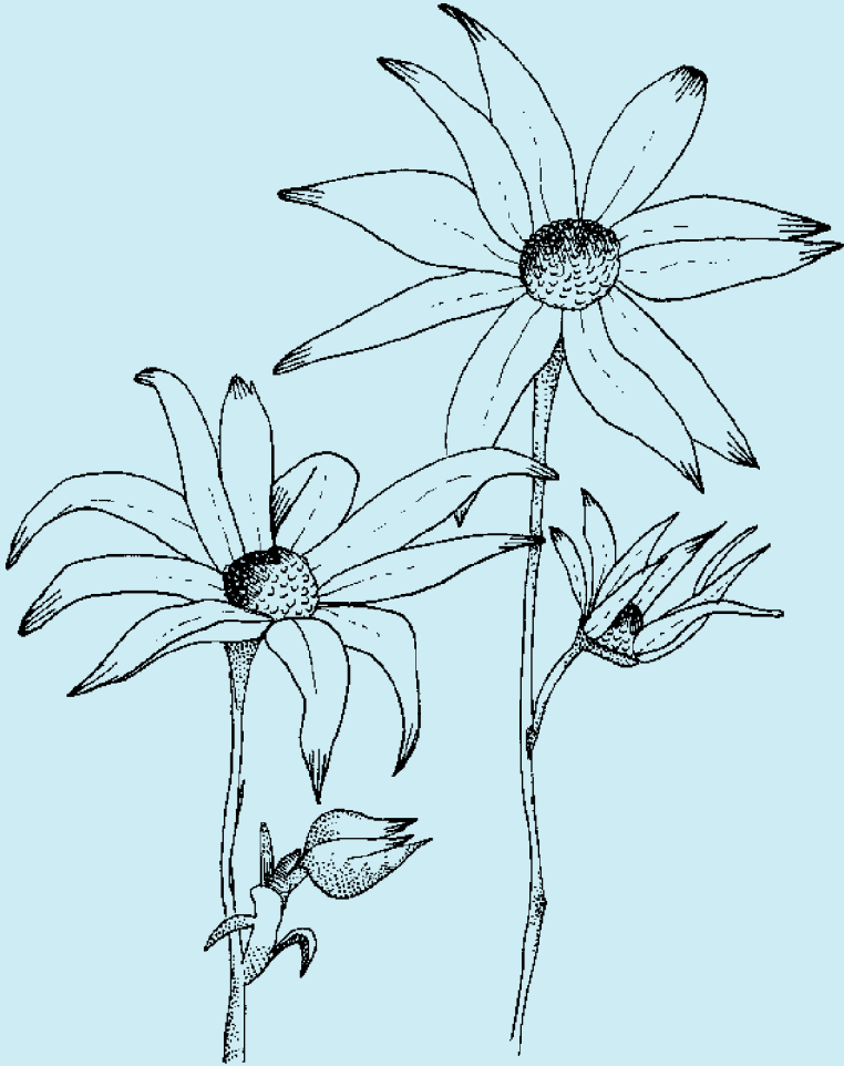
Flannel Flower (Actinotus helianthi)