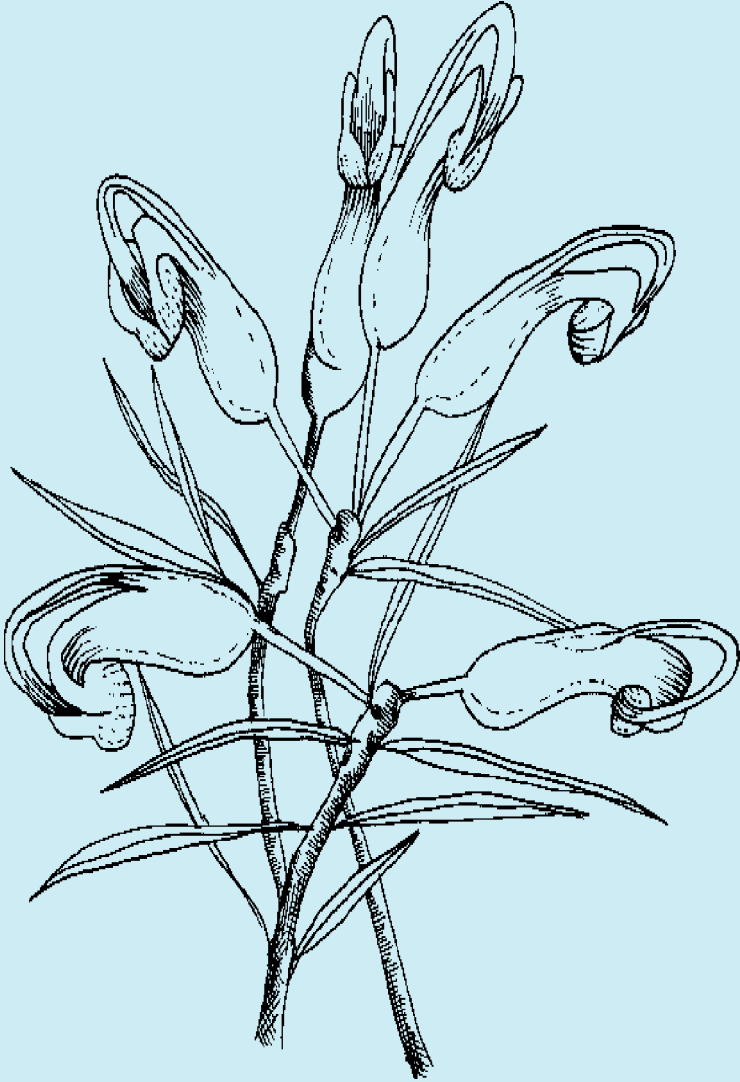
Pink Spider Flower (Grevillea sericea)