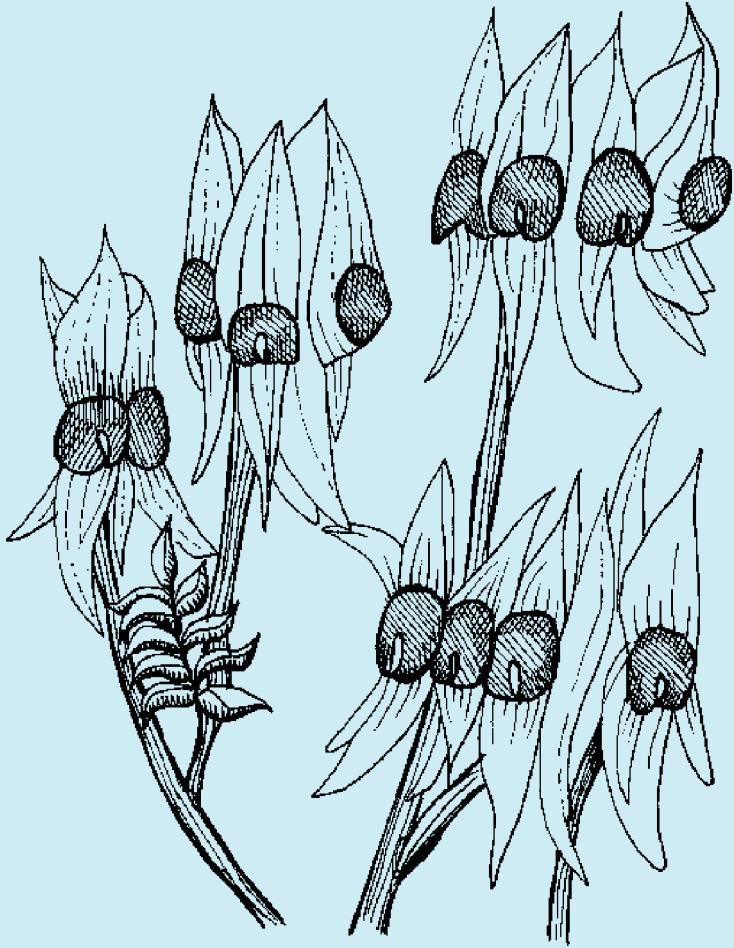
Sturt's Desert Pea (Lianthus formosus)