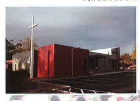
New Donvale Church

You may prefer to be more specific in making your bequest. Should you desire this, the best course is to check your proposed cause and wording with the General Manager of the Presbyterian Church to best express your intentions.